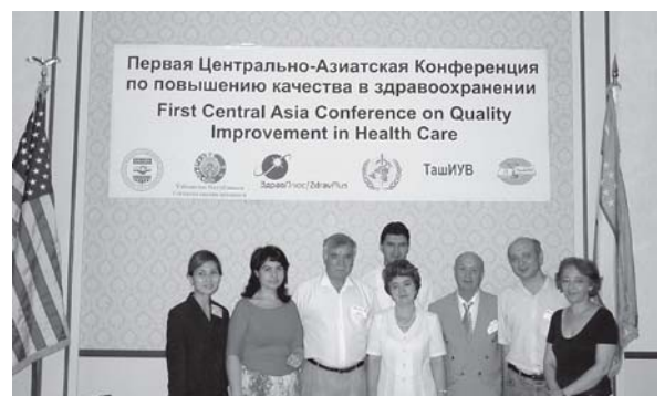
GP Association members attend a Conference on Quality Improvement held in Tashkent

In addition to the Bulletin, General Practitioners’ Association members are active in many other areas. In a continual effort to improve their own knowledge and provide the best services available to their members they actively participate in medical conferences and expect to plan their own in the future. The GP Association would also like to be able to provide legal support to family doctors who are in difficulty and will look at hindrances to the practice of family medicine – such as outdated sanitary requirements and the paperwork required of family doctors – in order to make recommendations for improvement. Members of the General Practitioners’ Association are very proud of their initial successes and are working hard to continue improving the quality of GP care in Uzbekistan.